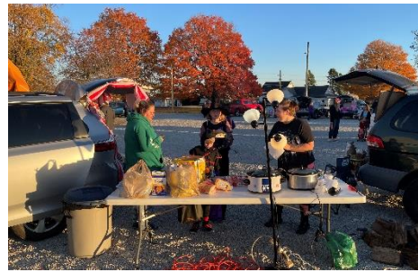
There was hot apple cider, roasting of hot dogs and other foods.